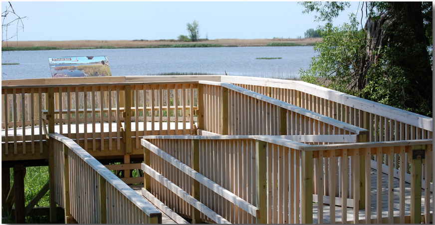
Peshtigo Harbor Wildlife Area observation deck on Wynegar Pond

Famous in the annals of Wisconsin logging. The only traces of a once-flourishing settlement are the rows of piles built out into the bay to handle shipping.