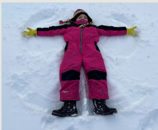
Kelsey McNulty created a snow angel