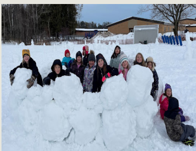
Second grade students built a fortress